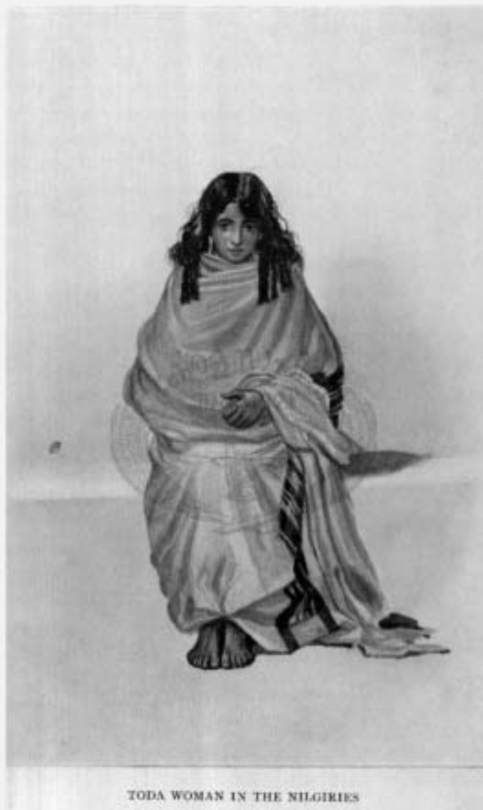
TODA WOMAN IN THE NILGIRIES